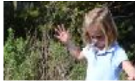
CHARLOTTE Red Fox!

WHICH NOCTURNAL ANIMAL IS YOUR FAVORITE?